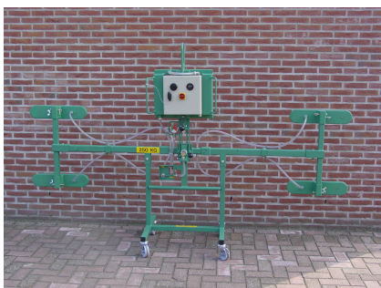
Sandwich panel lifter.

The machine works on battery, and can turn and tilt 360 degrees. There are 4 pads which can change position. There is a second holding device, you have to use during lifting. Maximum weight 250 kg, own weight about 75 kg. You also have the possibility to remove the vacuum pad and change it, for instance, for a oval 500 pad, this way you will have a basic machine for all the difficult lifting situations.